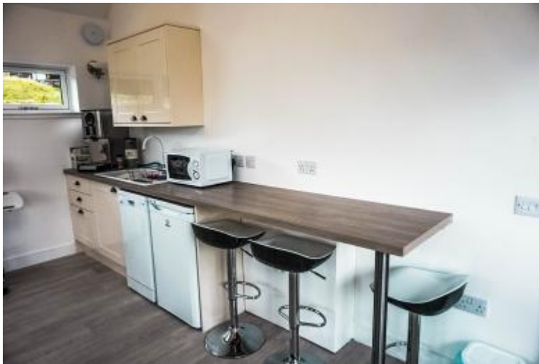
Breakfast bar has a clearance of 880 mm.