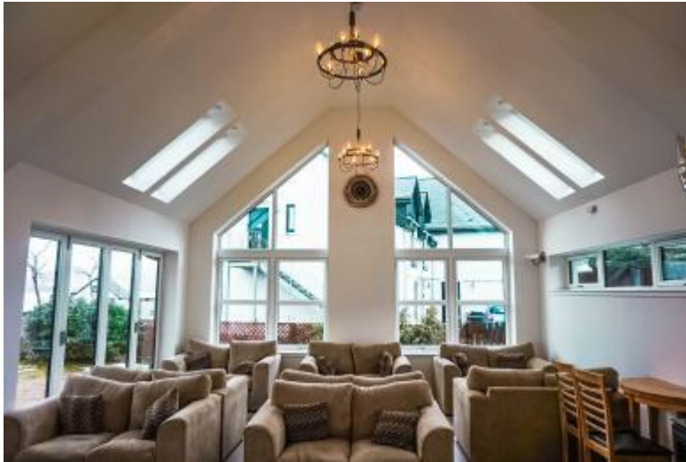
Seating in the lounge