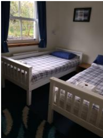
Room 7 has a single and a double bed