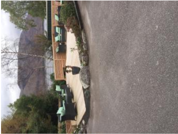
Entrance to garden from the car park