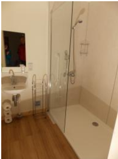
Room 1 shower