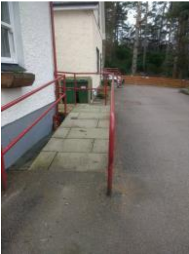
Ramp entrance to accommodation