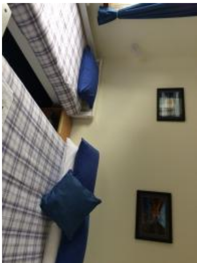
Room 7 has a single and a double bed