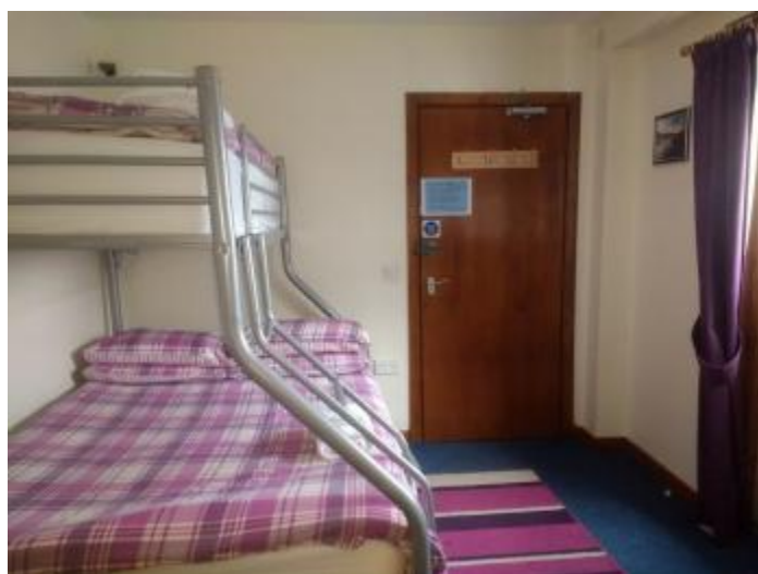
Room 1 door entrance to room