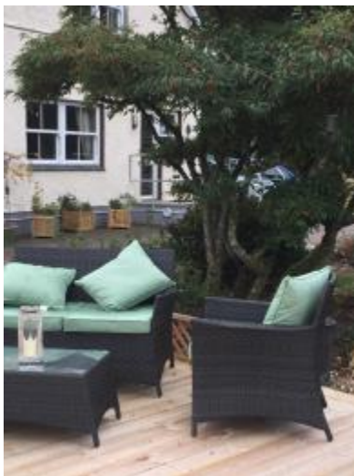
Decking in the garden