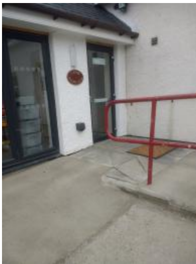
Ramp access to lounge