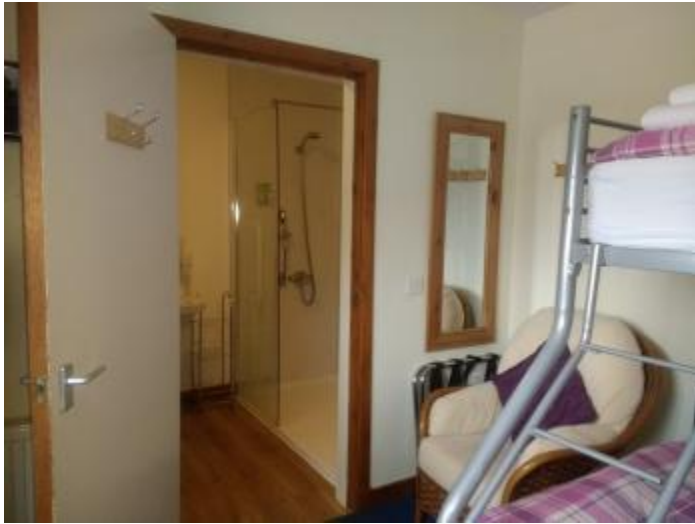
Room 1 access to bathroom