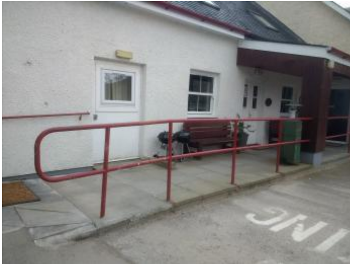
Railings and ramp to accommodation