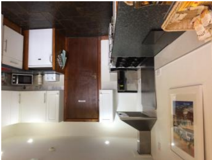
Kitchen Bunkhouse 2