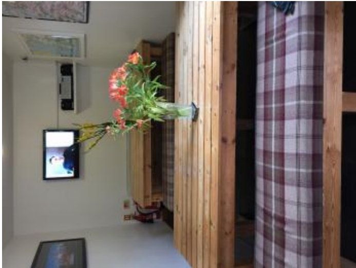
Dining room Bunkhouse 2