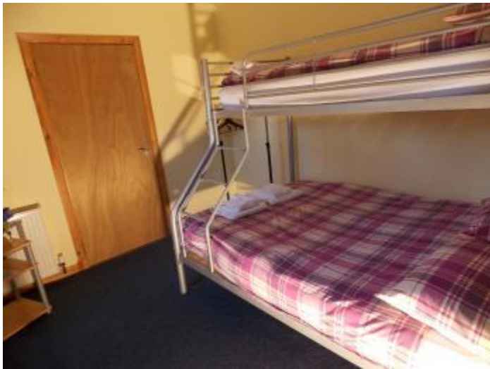
Room 1 double or twin