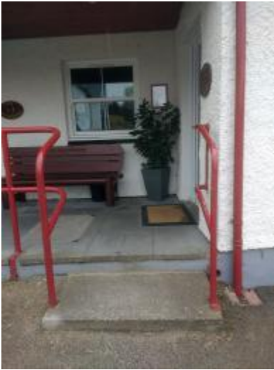
Main entrance to accommodation