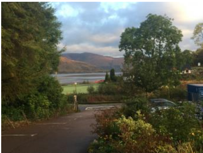
Main entrance to our accommodation with the garden on the right.